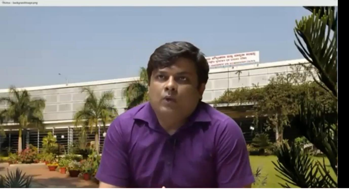
Quality Assurance ,Accreditation and Assessment in higher Education,(N Cyprus)